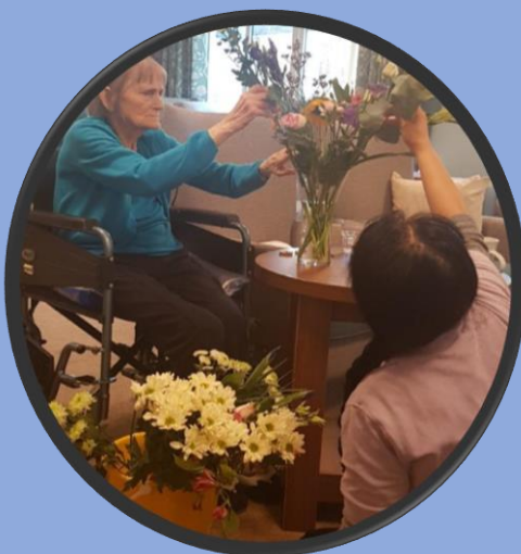
Resident and staff seriously enjoying a session of flower arrangement

Residents and staff at Four Acres are happy to launch our first News letter