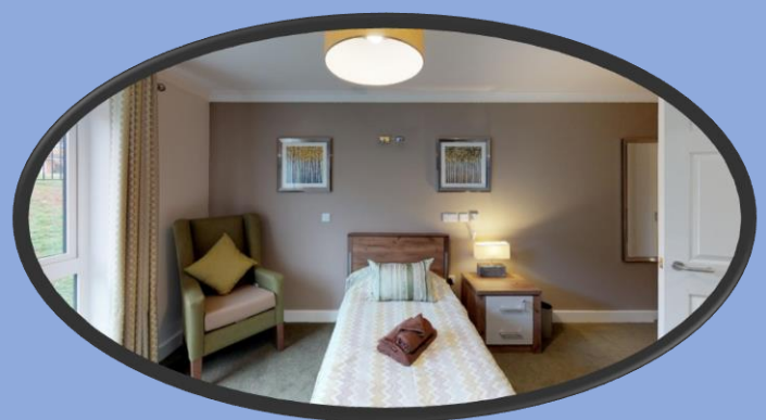
View of our unique bedroom