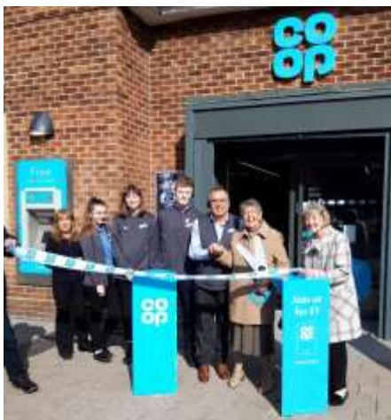
Opening the newly refurbished Co-Op